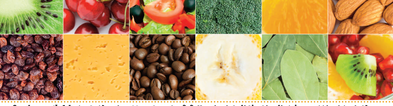
Good news! We took the guesswork out of following a diabetic diet by putting together a seven-day, 1600 calorie meal plan, including three meals plus snacks. These meals include key vitamins and minerals, avoid refined grains, and limit added sugars. Plus, recipes are included for select * items. Each meal and snack is planned to help you keep your blood sugar in check.